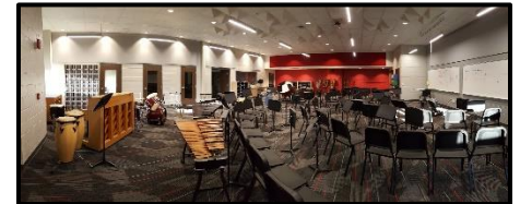
Middle School Band Room

Completing some of the projects during the school year has lessened the load for this summer and allowed us to celebrate when some of the projects were completed. The new secure sequence at the high school has served as a model for the other four buildings, which will have their entrances renovated this summer. The Lincoln gym was officially opened for Fine Arts Night in March. We can now hold school-wide assemblies at Lincoln.