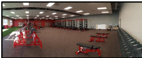
High School Fitness Room