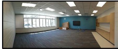
Lincoln Elementary Classroom