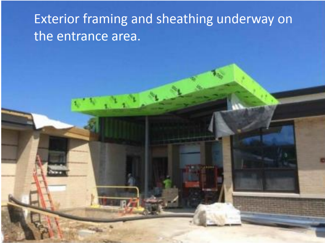
Exterior framing and sheathing underway on the entrance area.