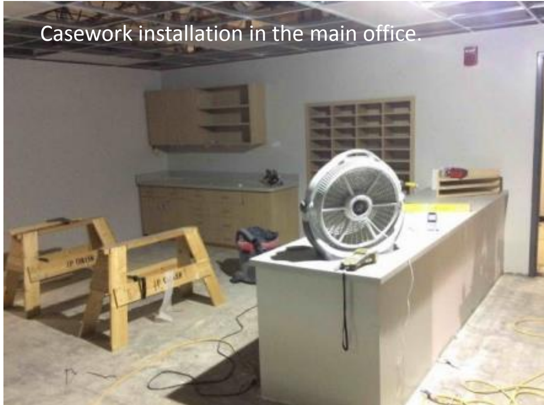
Casework installation in the main office.