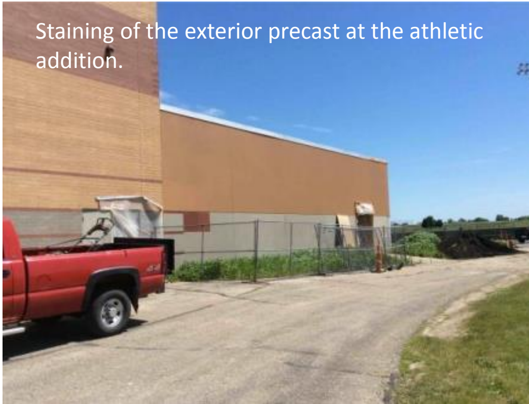
Staining of the exterior precast at the athletic addition.